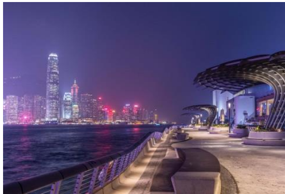
Take in the Hong Kong skyline from all angles