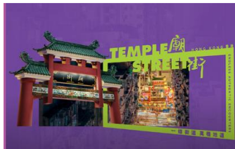
And many more to explore!