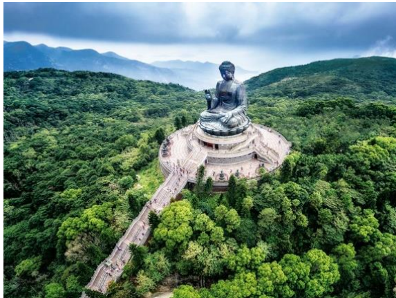
Climb the steps up to the Big Buddha