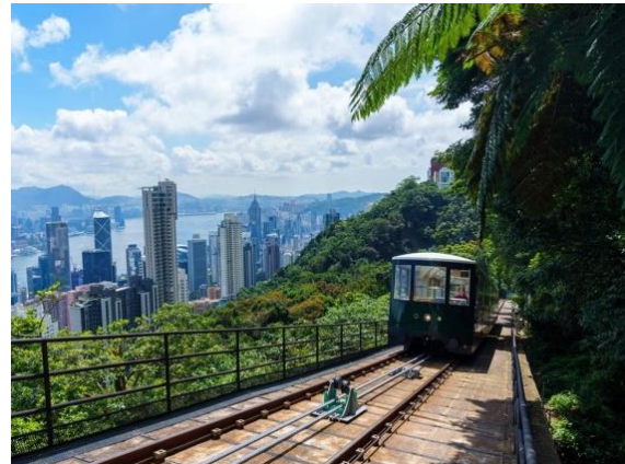
Gaze across Hong Kong and Kowloon from The Peak