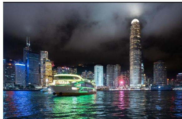
Get on the Victoria Harbor Cruise Trip Banquet!