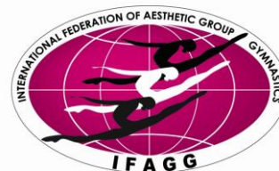
INTERNATIONAL FEDERATION OF AESTHETIC GROUP GYMNASTICS (IFAGG)