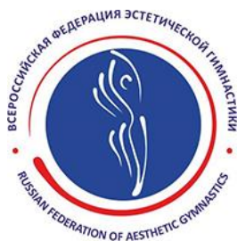
RUSSIAN FEDERATION OF AESTHETIC GYMNASTICS (RFAG)